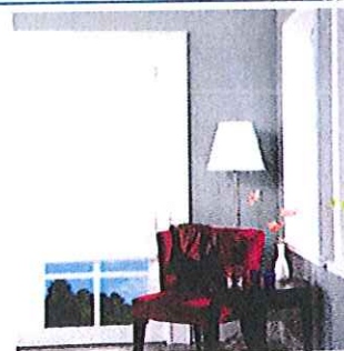
Kansas White Rollup Blind (No release device)

CPSC is still interested in receiving incident or injury reports that are either directly related to this product recall or involve a different hazard with the same product. Please tell us about it by visiting https://www.cpsc.gov/cgibin/incident.aspx .