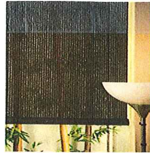
Zen Moss Rollup Blind (No release device)