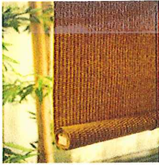
French Rollup Blind Antique Gold (No release device)